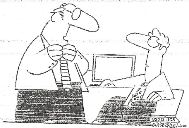
"Pardon me—when I suck the enthusiasm out of a new employee too quickly, I get gas!"